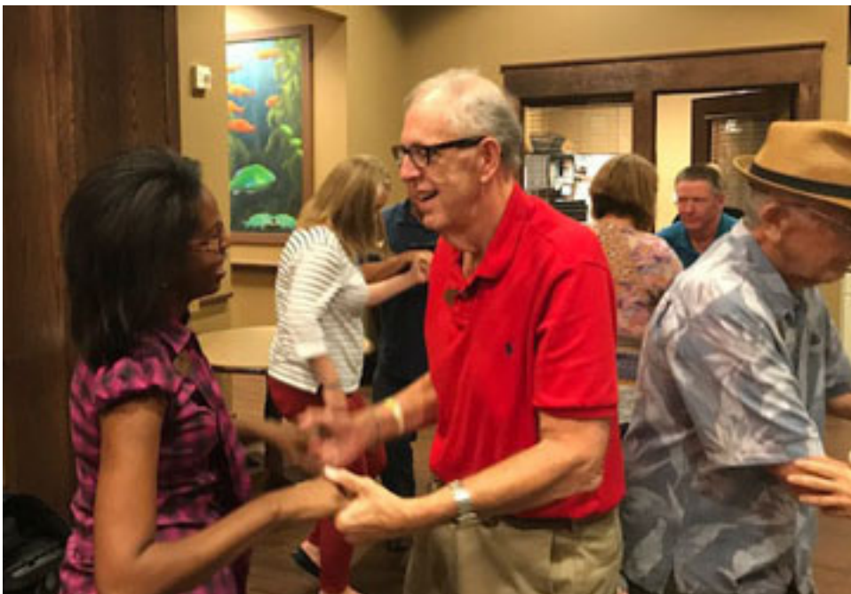
A newfound love of dancing