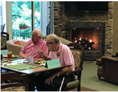
Lunch with friends